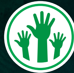
Human Rights and Peacebuilding