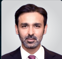
Syed Ali Musa Gillani Elected President of Young Parliamentarians Forum & MNA