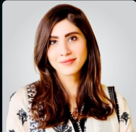
Hina Pervaiz Butt Member of the Provincial Assembly