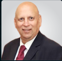
Ch. Mohammad Sarwar Governor of Punjab, Pakistan