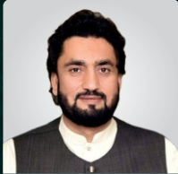
Shehryar Khan Afridi Committee on Kashmir and Former Federal Minister Interior, Narcotics Control and States and Frontier Regions (CAFROW)