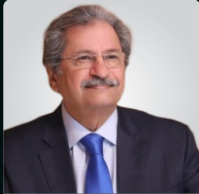
Shafqat Mahmood Federal Minister for Education and Professional Training