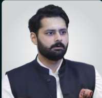
Jibran Nasir Civil Rights Activist and Lawyer