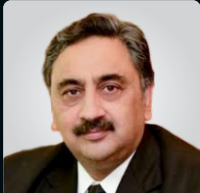
Ahmer Bilal Soofi Former Federal Minister for Law, Justice & Parliamentary Affairs