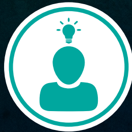
Business and Entrepreneurship