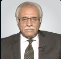
Ahmad Awais Advocate General of Punjab, Pakistan