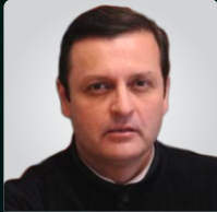
Walid Iqbal Member of the Senate, Pakistan