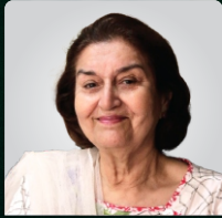
Justice @ Nasira Javed Iqbal Former Judge of Lahore High Court