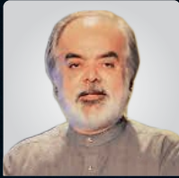
Nawab Ghous Bakhsh Barozai Former Chief Minister of Balochistan