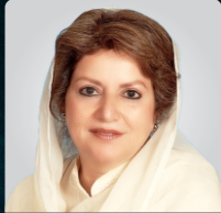
Shaista Pervaiz Member of the National Assembly, Pakistan