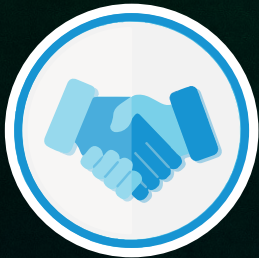
Policy and Civic Engagement