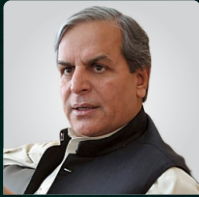
Makhdoom Javed Hashmi Former Federal Minister for Health and Youth Affairs