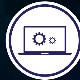
Information and Technology