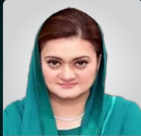
Marriyum Aurangzeb Federal Minister for Information and Broadcasting