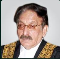
Iftikhar Muhammad Chaudhry Former Chief Justice of Pakistan