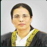
Ayesha A. Malik First Female Justice of the Supreme Court of Pakistan