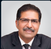
Senator Barrister Syed Ali Zafar Former Federal Minister for Law and Justice