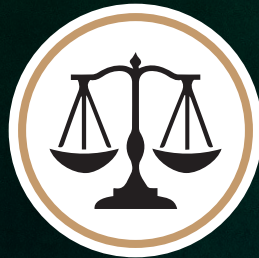
Law, Justice and Order