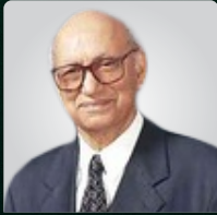
S.M. Zafar Former Senator and Federal Minister for Law and Parliamentary Affairs