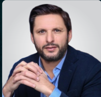
Shahid Afridi Former Captain of Pakistan Cricket Team