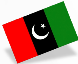
PAKISTAN PEOPLES PARTY