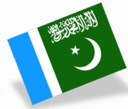
JAMAAT E ISLAMI PAKISTAN

Beyond The Youth Invited representative of Major Stakeholders