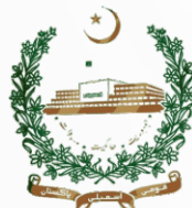
NATIONAL ASSEMBLY OF PAKISTAN