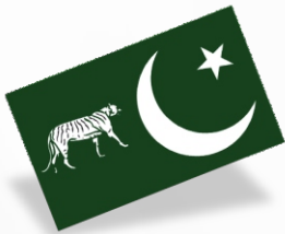
PAKISTAN MUSLIM LEAGUE (N)

Beyond The Youth Invited representative of Major Political Parties