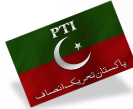
PAKISTAN TAHREEK E INSAAF