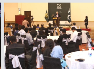
Annual Dinner 2022 hosted by Youth General Assembly. Dated: April 1, 2022