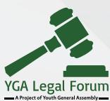
YGA Legal Forum — A Project of Youth General Assembly —

The YGA Legal Forum is Pakistan's first youth-led national legal forum, with the primary goal of establishing the youth as a driving force behind justice in society.