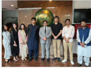
Presidents of YGA's International University Chapters on a study tour to the Parliament of Pakistan. Dated: September 09, 2024