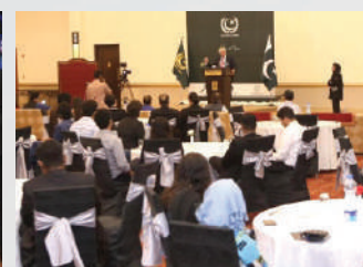
Annual Dinner 2022 hosted by youth General Assembly. Dated: April 1, 2022